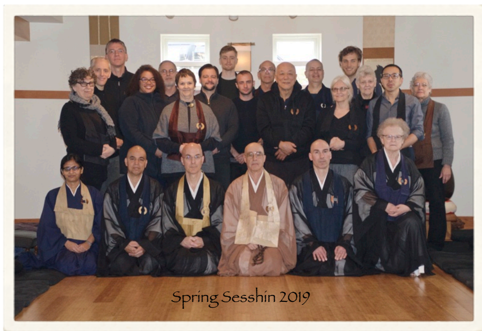
Spring Sesshin 2019