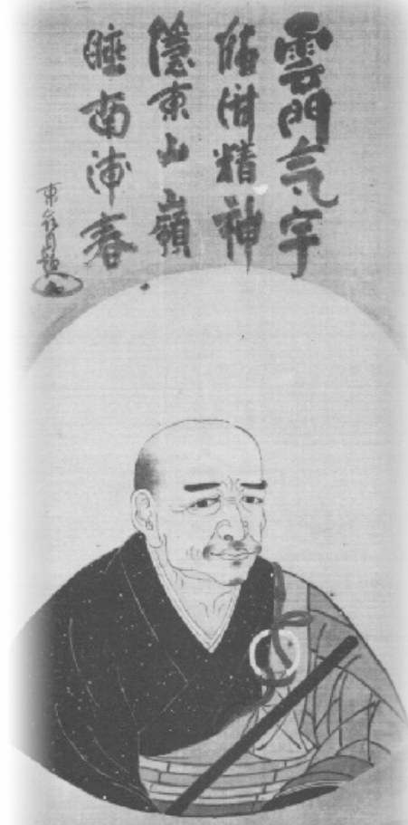
Tōrei Enji (1721–1792)

All this was happening at a time when Hakuin, now in his seventies, was traveling