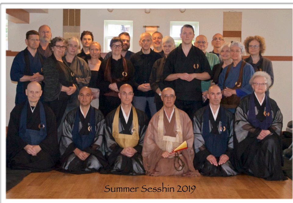
Summer Sesshin 2019